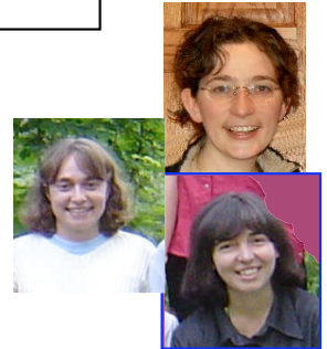
Apostles of the Interior Life

www.springtimeofhope.org or call 563-583-6117